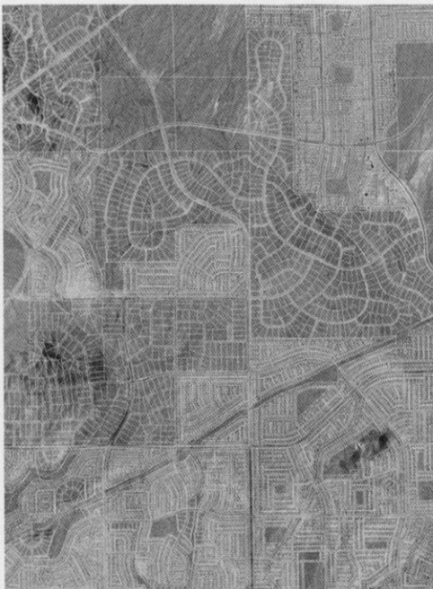
California City - Parcelation Plan (detail), based on archival material, 2010